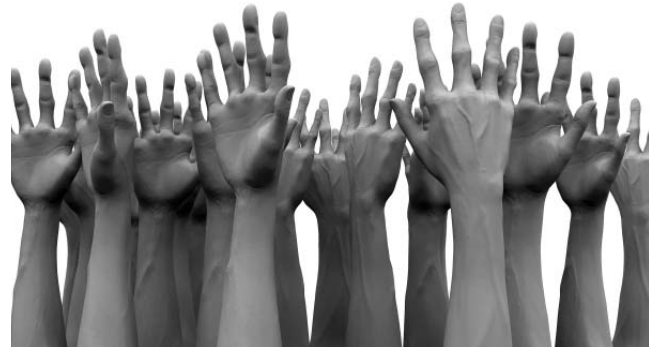
Bridges is blessed to have so many people contribute to our programs.

We have a new brochure for Bridges — thanks to the creative talents of Dawn